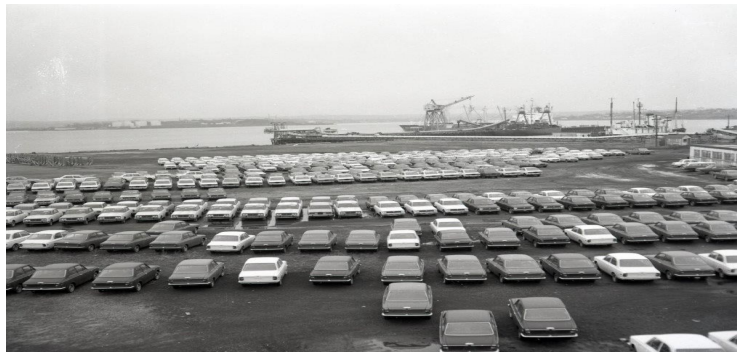
Unloading of Toyota cars at Point Edward