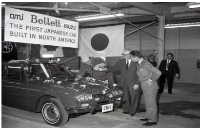
First Izuzu Bellet 1968

The facility was created by Canadian Motor Industries. It was located in the Point Edward Industrial Park, a former Royal Canadian Navy base. The first car assembled there was an Izuzu Bellet in 1968. The first Toyota came off the line in 1970. It was called the Toyota Canadian and was a 2-door version of the Corolla. Other Toyota models were also imported into Canada through Sydney harbour. The facility was only operated till the mid-1970's, when the new Toyota facility was built in Ontario.