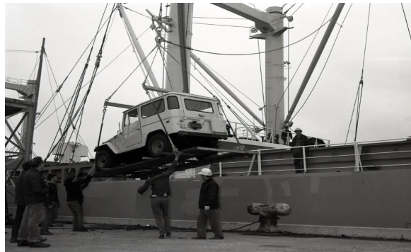
Unloading Toyota Land Cruiser at Point Edward