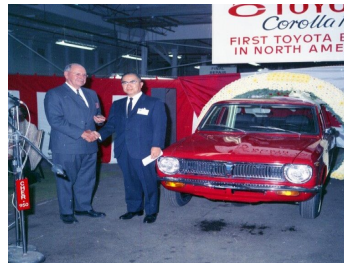
First Toyota Canadian 1970